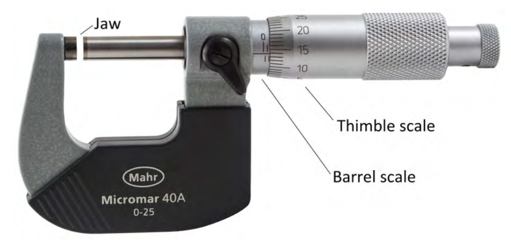
Image source: Lucasbosch, CC BY-SA 3.0, labels are added to the image

4. For more precise measurements, find where the thimble scale lines up exactly with the axis of the barrel scale. Each mark on the thimble scale represents 0.01 of a mm. If this is 33 then add 0.33 to the barrel scale reading (14.5 mm) to find the measurement is 14.83 mm.